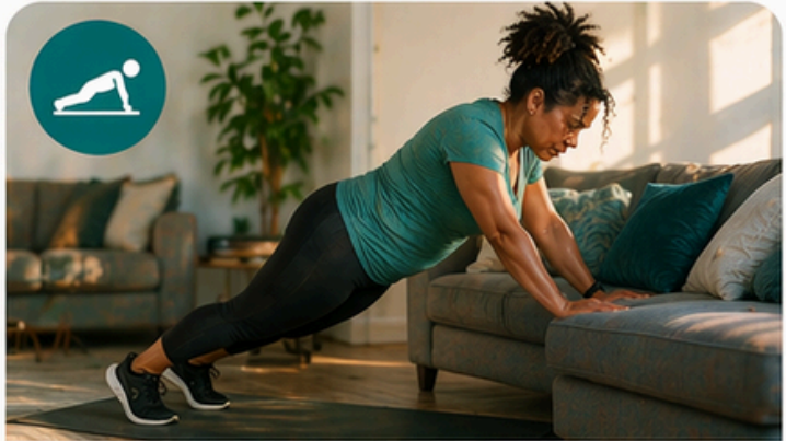
Incline Push-Ups 3 Sets x 8-12 Reps