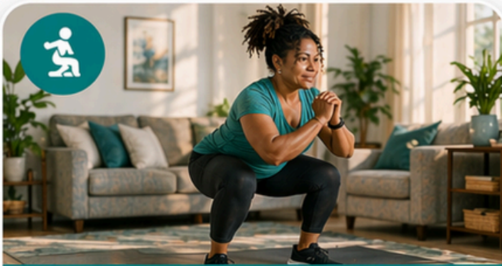
Bodyweight Squats 2 Sets x 10-12 Reps

Even on your busiest days... this is enough.