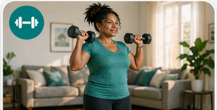
Shoulder Press (Light Dumbbells or Bands) 2 Sets x 10-12 Reps