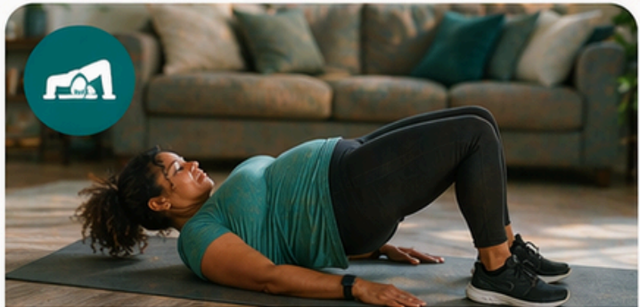
Glute Bridges 3 Sets x 12-15 Reps