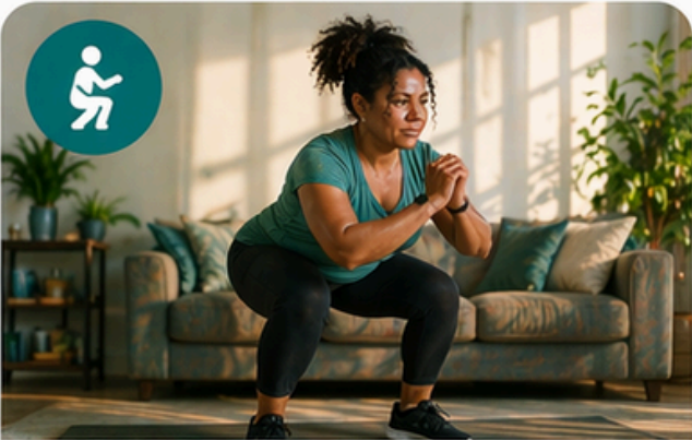
Bodyweight Squats 3 Sets x 12-15 Reps

Don't overthink this. Just move your body.