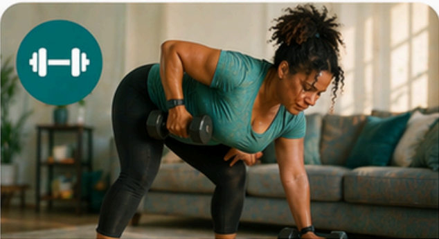
Bent-Over Dumbbell Rows 3 Sets x 10-12 Reps