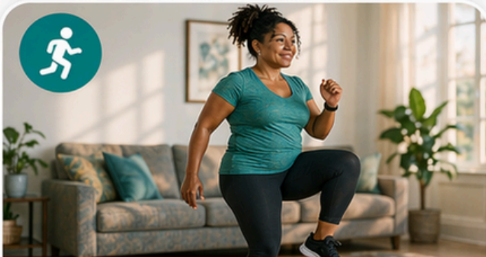
Standing March or High Knees 2 Sets x 60 Seconds